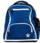
CHOOSE FROM ANY IN-STOCK DREAM BAG WITH $13 MSRP $99.00