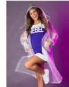
REBEL RAINCOAT $15.00