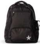
STRIKE DREAM BAG $76.50