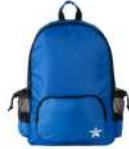
RAVEN BACKPACK $57.50